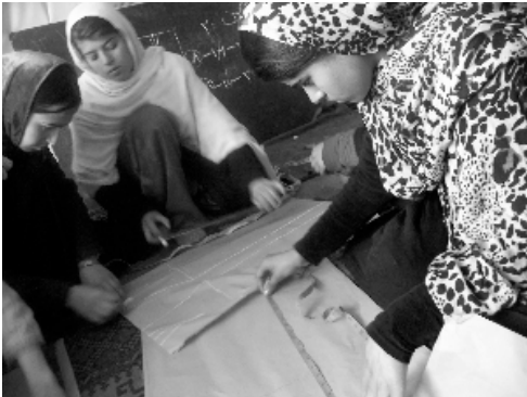
KABUL, Afghanistan -- Women and girls in one of RAWA's "income generation" projects, learn how to sew and embroider clothes.