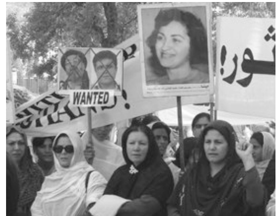
ISLAMABAD, Pakistan – Carrying images of Meena, Afghan women march at a RAWA demonstration against fundamentalism and war in their nation.

In 1977, a young Kabul University student named Meena, founded the Revolutionary Association of the Women of Afghanistan (RAWA) to struggle for women's freedom in a conservative country. After the 1979 Soviet invasion, RAWA expanded their mandate to fight against fundamentalist misogyny and foreign domination. For three decades they have empowered Afghan women through humanitarian aid and political agitation. After Meena's brutal assassination in 1987, RAWA continued their work underground and today are on the forefront of the women's rights movements. Their projects include schools and orphanages for boys and girls, literacy courses for adult women, health clinics, the publication of their political magazine, Payam-e-Zan, documentation of human rights abuses, and public demonstrations. RAWA is a non-sectarian, non-violent organization advocating secular democracy, women's rights, and human rights in Afghanistan. For more information, visit www.rawa.org .